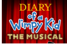
Youth Mainstage (Gr. 4-8)