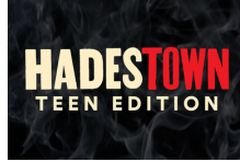
Teen Mainstage (Gr. 8-12)