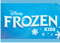
Young Performer's Academy (Gr. K-3)